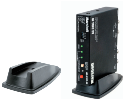
V-CB1 Desktop Stand